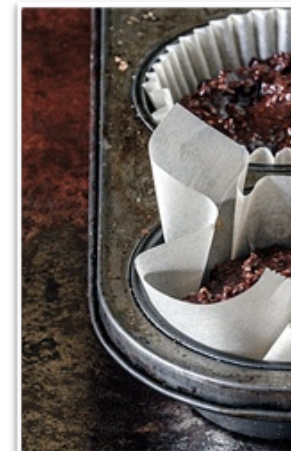
10 Uses for Parchment