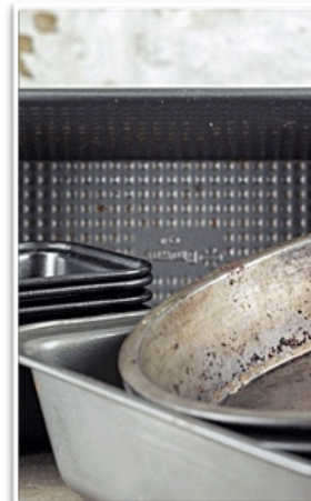
How to Adjust Cake Pan Size