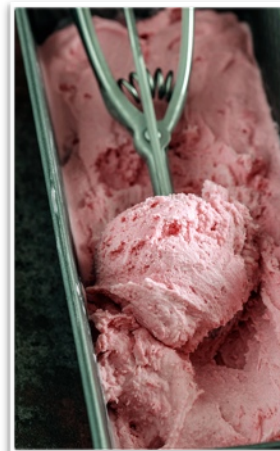
Strawberry Sour Cream Ice Cream