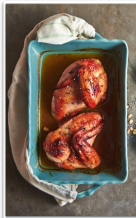
Easy Lavender Honey Chicken