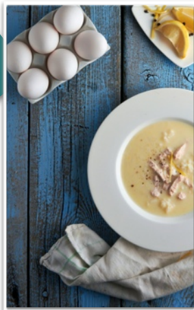
From Leftovers to Avgolemono Soup